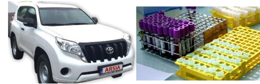
1 st line laboratories

Confirmation procedure (positive / dubious results)