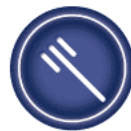
Sanitary Authority Food Safety Agency (AFSCA)

Invoice control & centralisation Laboratories Vet practitioners